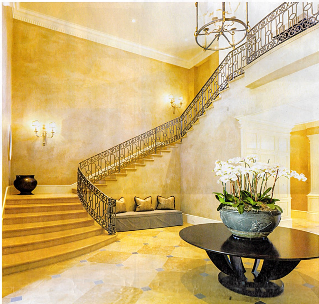
Right: The two-story foyer features a solid limestone staircase and extensive millwork. Below: Practice your chipping and putting at the home's private practice area. Bottom: The family room's fireplace offers recessed cabinetry beside its fireplace with antique stone mantle.