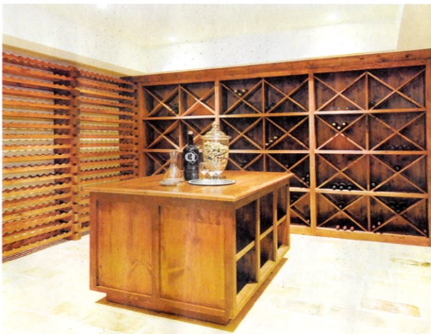
Top: The home includes a spacious terrace with outdoor kitchen. Above: The temperature-controlled wine room can store roughly 5,000 bottles on its redwood racks.