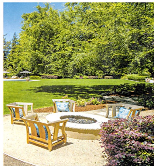
Left: The carpeted master bedroom includes a seating area and divided light windows looking out on the property. Right: The home's backyard includes a fire pit.