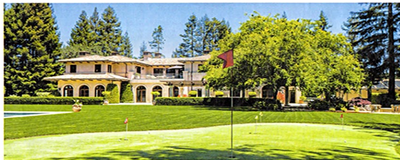
1 Faxon Road from page S15

Six sets of Palladian French doors open to the verdant grounds from multiple sides of the living room. Natural light pours into the room dominated by a floor-to-ceiling mantle sourced from a castle in Normandy. Just off a foyer with honed limestone flooring stands a banquet-sized formal dining room with two crystal chandeliers, plaster walls, wainscoting and extensive millwork.